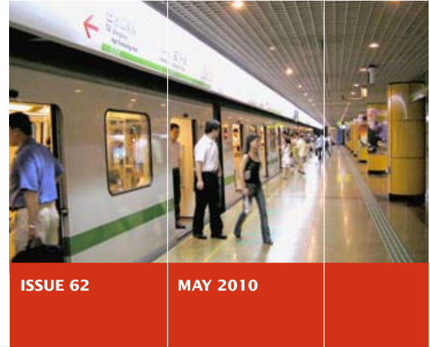
Shanghai Metro, Shanghai, China.