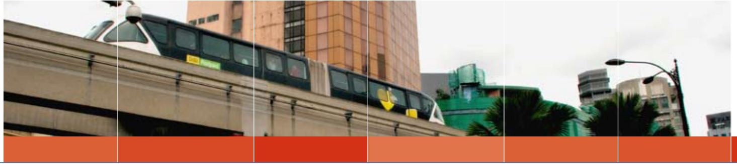
KL Monorail, Prasarana Group, Kuala Lumpur, Malaysia.